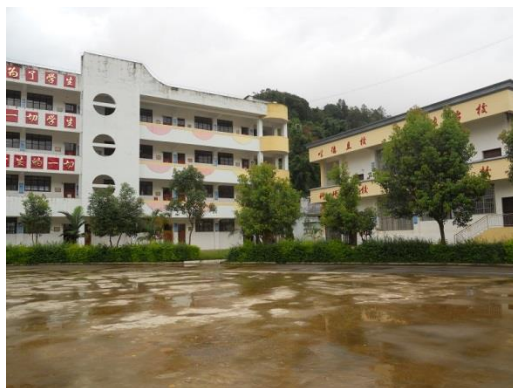
Jinping County Second Elementary School – English Program Site