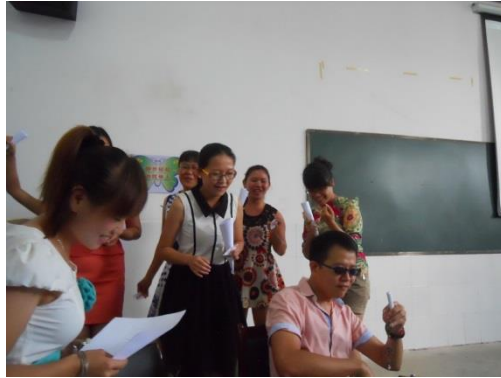
Talent Show – The Lost Son