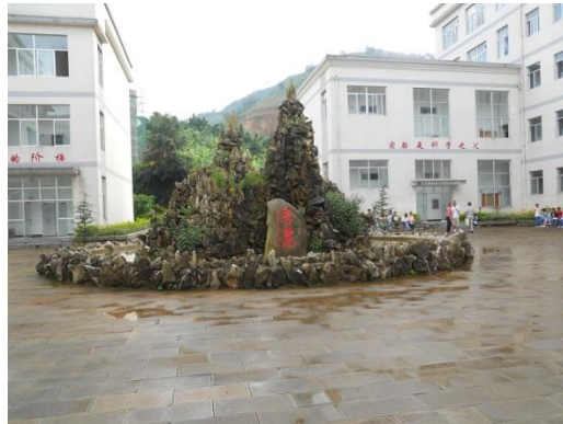
Jinping County High School – Youth Camp Site

The Program ran from July 25 for 7 days until July 31 with closing ceremony on August 1. There were 67 students in the Youth Camp (5 classes) which was located at Jinping County High School and 41 trainees in the English Program (3 classes) which was located at Jinping County Second Elementary School. We began the programs with ice-breaking games and self-introduction.