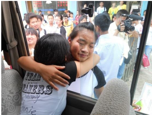
So long, farewell

We visited a student who had been sponsored by CRRS USA. We were touched by the whole family for their gratefulness for our support and care.